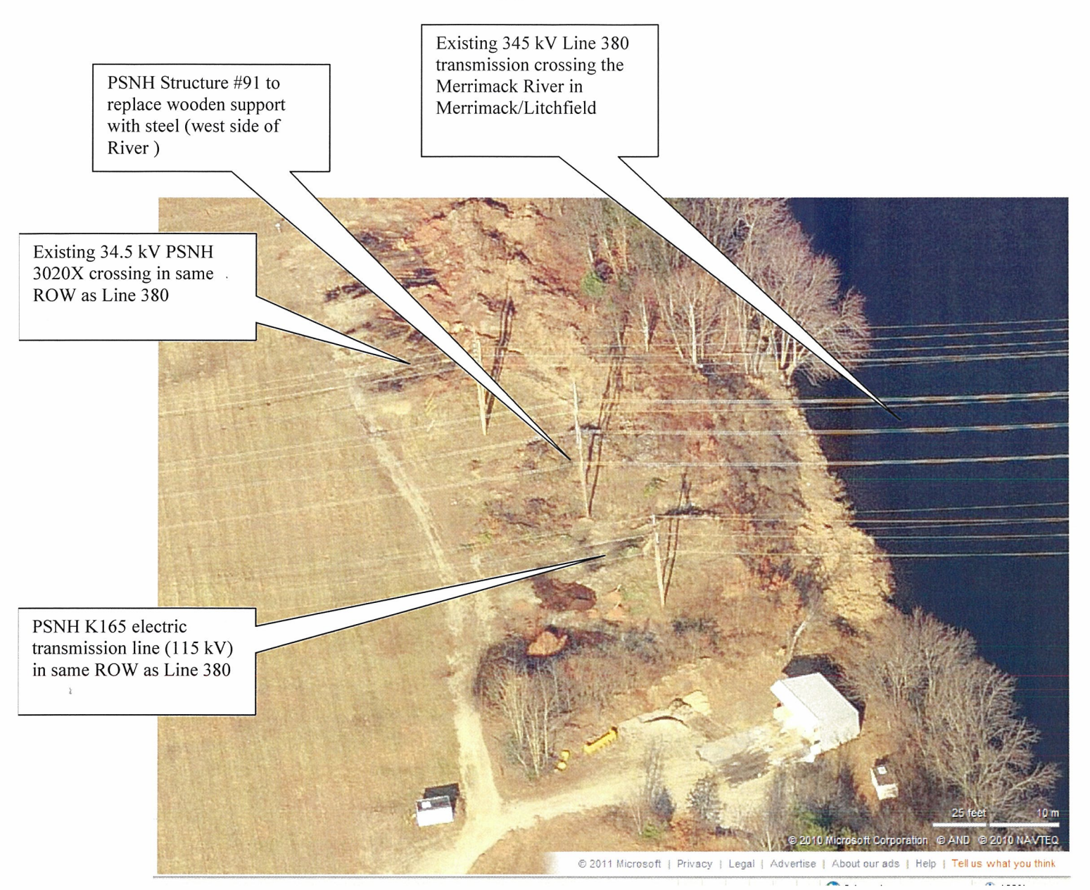
Figure 1. Closer View of Merrimack River Crossing (west side), Merrimack, NH. Note storage building is not on PSNH property and is just south of PSNH owned parcel.