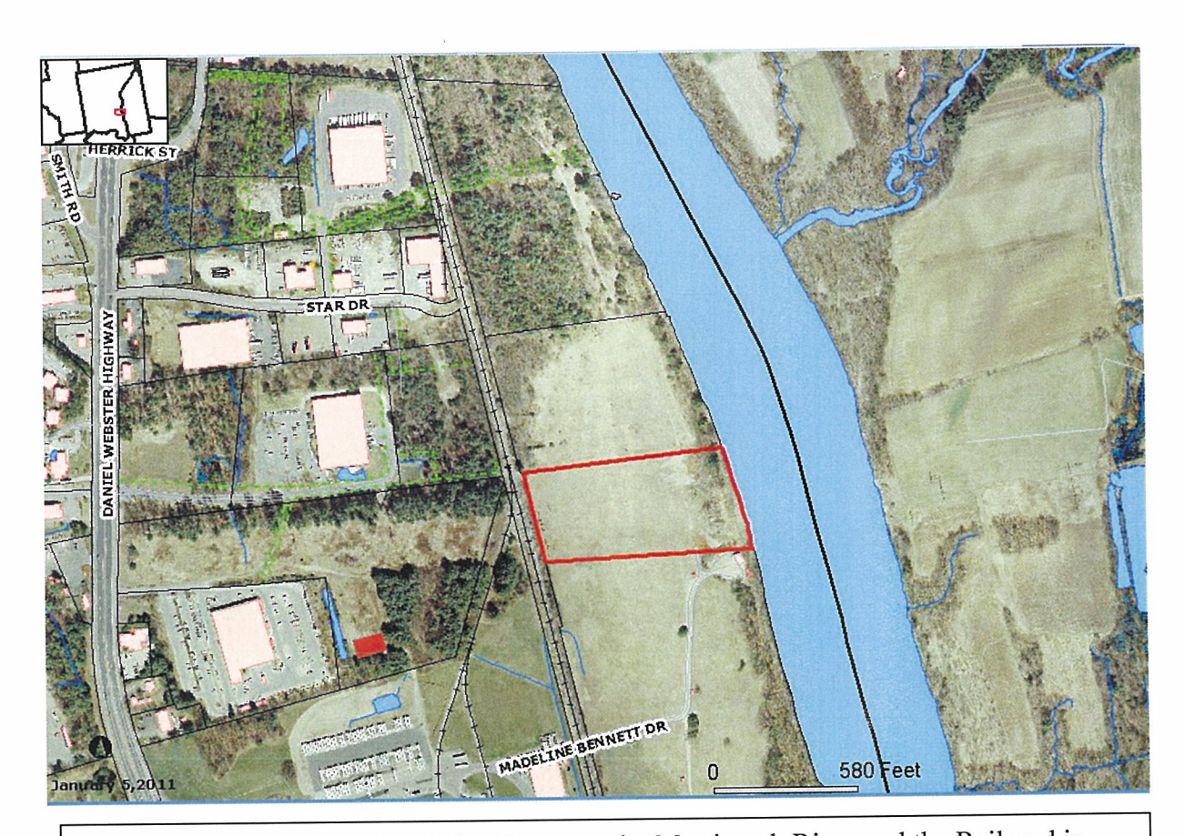
Figure 3. Parcel in Merrimack, NH between the Merrimack River and the Railroad in which Structure 91 will be replaced. Information source is derived from on-line GIS database of the Town of Merrimack, NH.