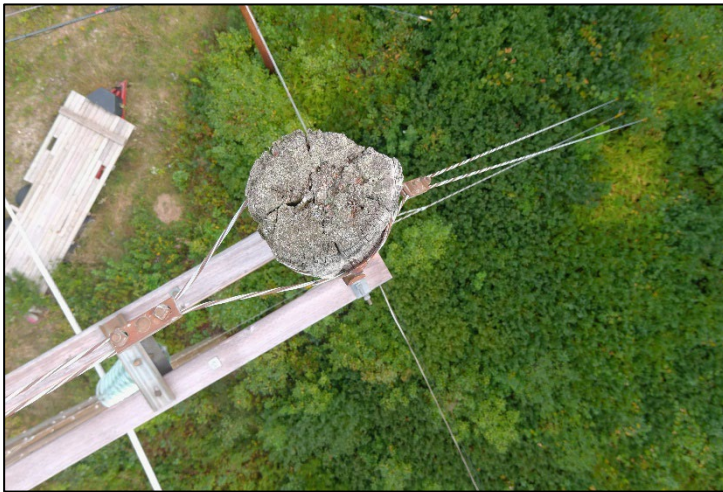
Structure 119 – Top rot, rust