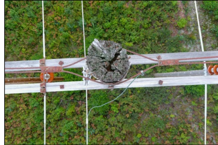
Structure 155 – Top rot, splits, rust