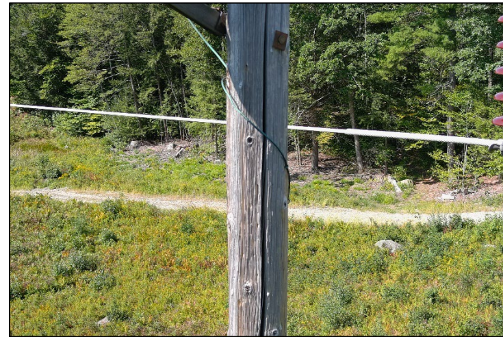
Structure 190 – Pole splits