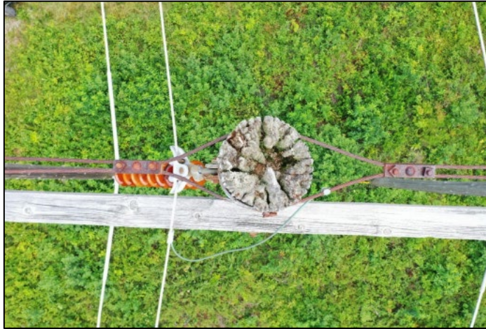
Structure 21 – Top rot, hollow at pole top, rust, splits