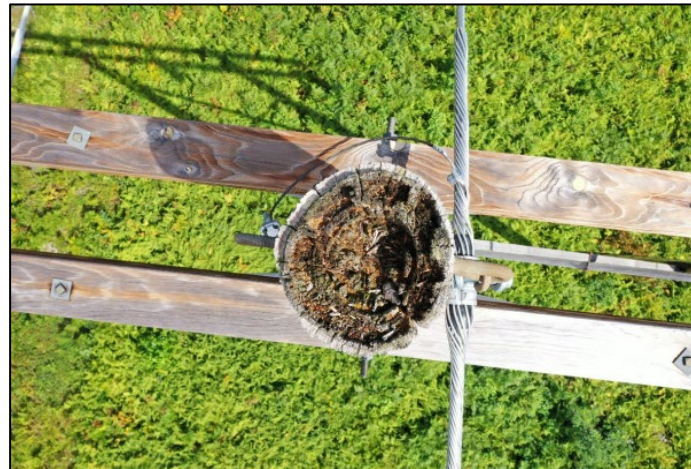
Structure 286 – Top rot, hollow at pole top