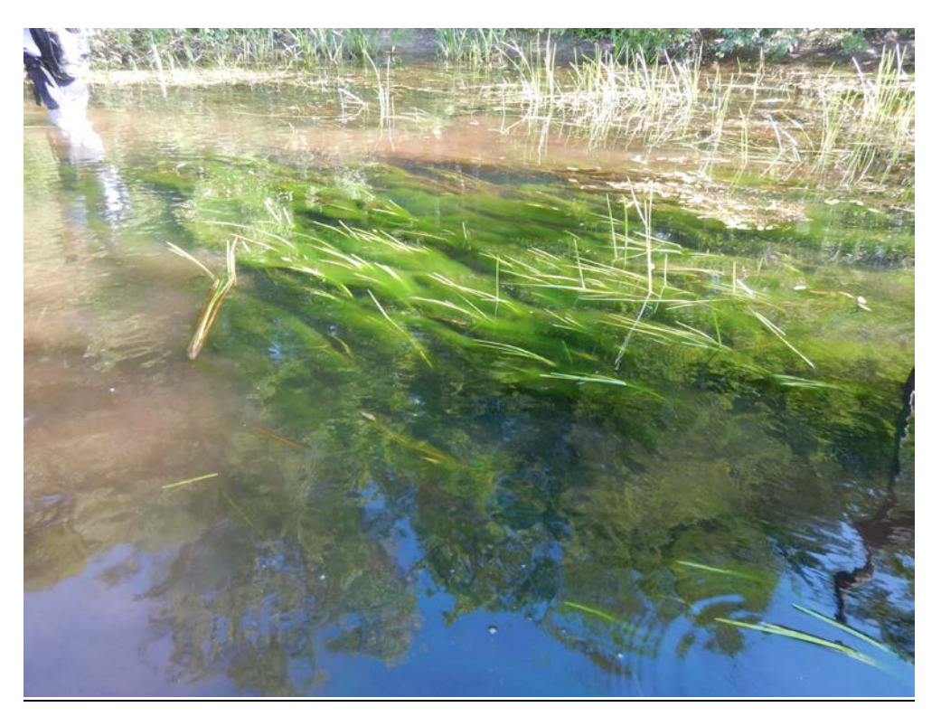
<u>Photo 1189</u>: Looking south at Warner River channel at the mouth of Schoodac Brook. Algal bloom appears suddenly at this point in the river.