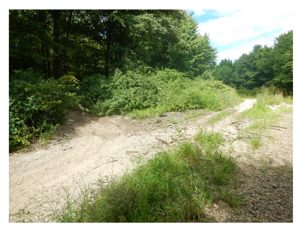
<u>Photo 1207</u>: Looking north along river-right bank of the Warner River at all-terrain vehicle tracks in the riverine, scrubshrub/emergent wetlands, which are jurisdictional under Env-Wt 100-900.