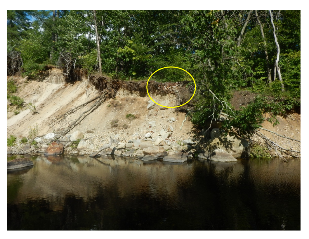
<u>Photo 1223</u>: Looking north at the river-left bank of the Warner River, which is eroding. At center of photo, the top of bank material includes an old dump, which is contributing waste materials to the river channel.