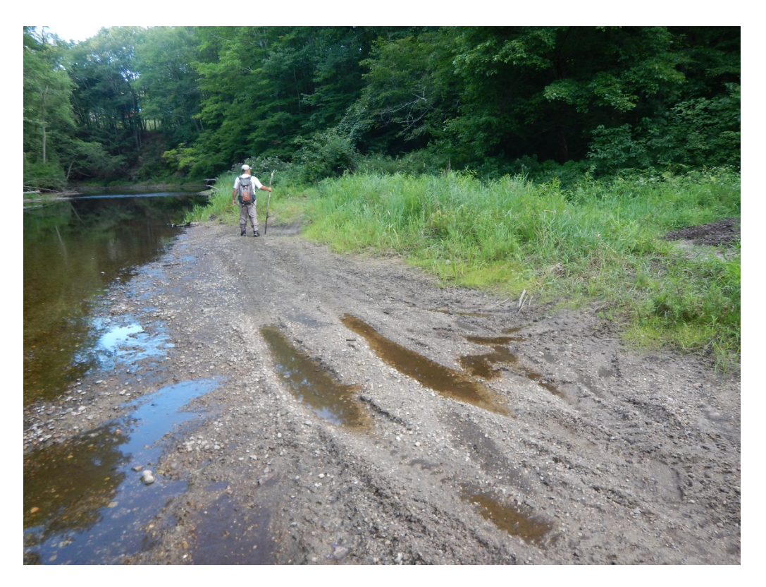
<u>Photo 1232</u>: Looking southeast along the river-right bank of the Warner River at all-terrain vehicle tracks in the riverine, emergent wetlands, which are jurisdictional under Env-Wt 100-900.