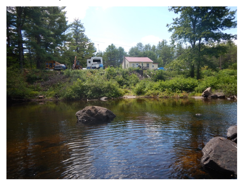
<u>Photo 1213</u>: Looking south at the river-right bank of the Warner River at development at the end of Willey Lane (perhaps #38 according to Google Maps). Extensive clearing of vegetation and possible filling of unknown provenance (e.g, timing, permitting status) in areas under the jurisdiction of Env-Wt 100-900 and Env-Wq 1400.