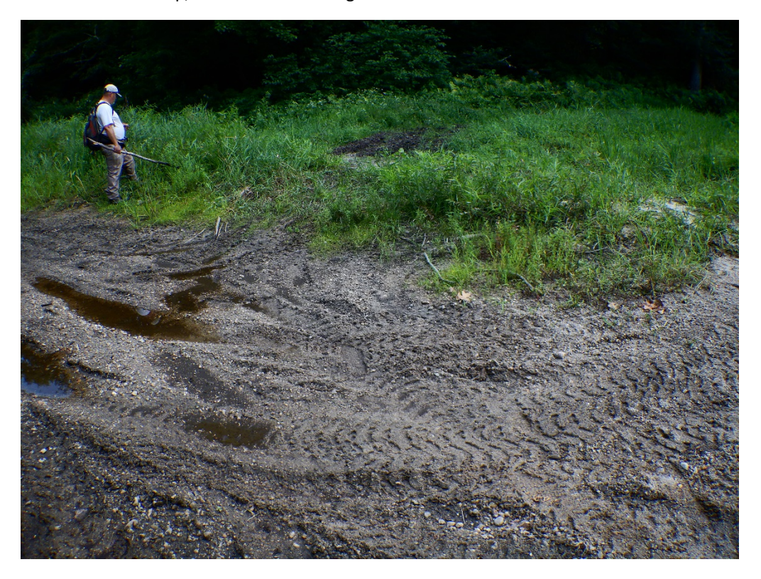
<u>Photo 1231</u>: Looking south at the river-right bank of the Warner River at all-terrain vehicle tracks in the riverine, emergent wetlands, which are jurisdictional under Env-Wt 100-900.