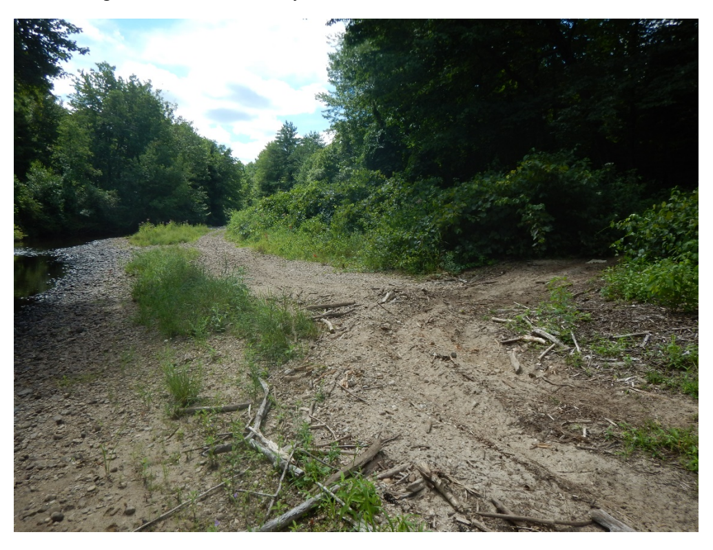
<u>Photo 1208</u>: Looking south along river-right bank of the Warner River at all-terrain vehicle tracks in the riverine, scrubshrub/emergent wetlands, which are jurisdictional under Env-Wt 100-900.