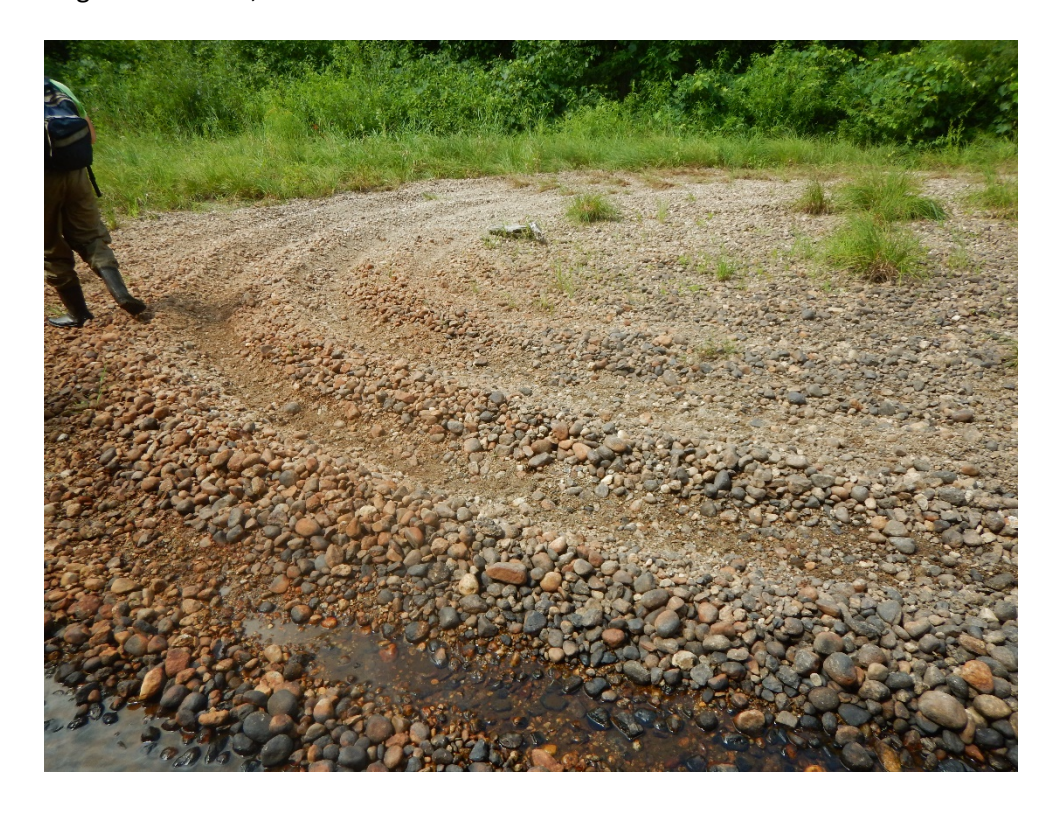
<u>Photo 1209</u>: Looking southwest along river-right bank of the Warner River at all-terrain vehicle tracks in the riverine, emergent wetlands, which are jurisdictional under Env-Wt 100-900.