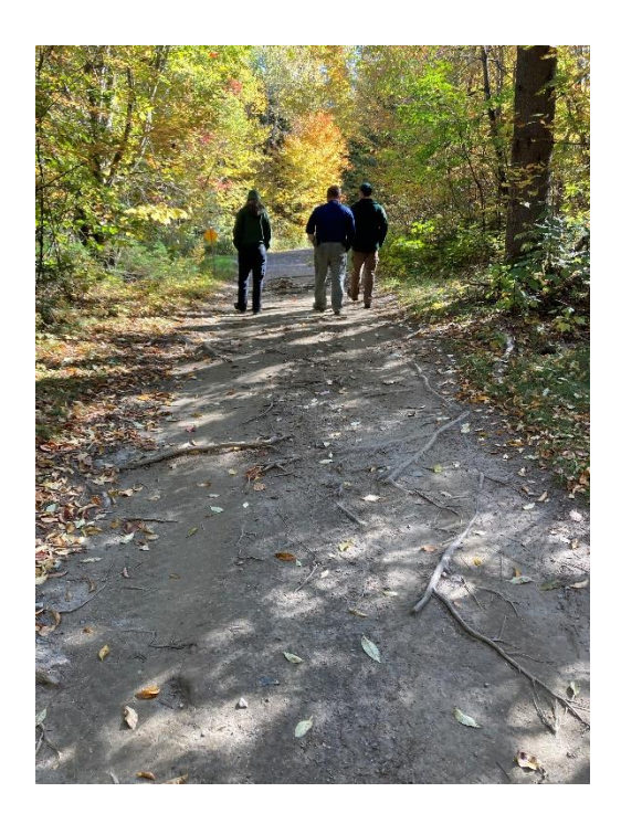
Figure 4- Shows the condition of the trail and the noted exposed roots.

The hill leading up to the kiosk was a rougher than years past when more maintenance was completed. The rubber water diversion devices were completely filled in with material and were not functioning properly.