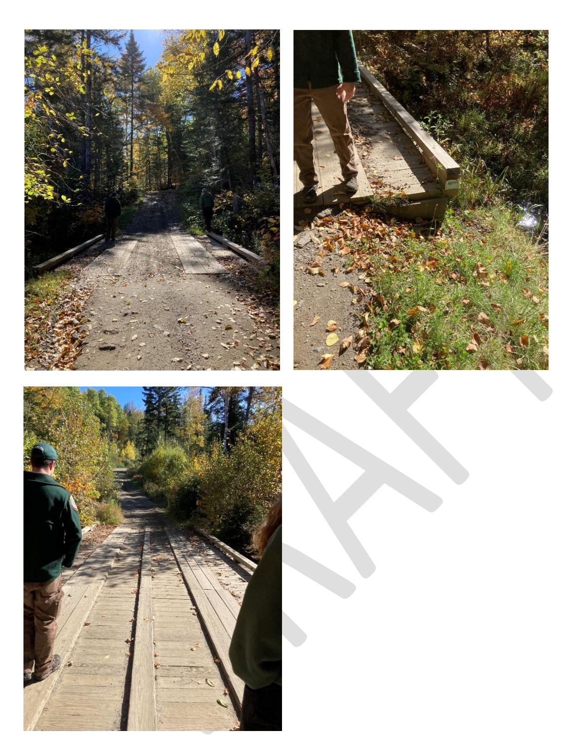
Figure 3- Shows the condition of the bridges (top left- first bridge, top right- second bridge, bottom right- large bridge over East Branch of Simms Stream)

It was noted that the roots from the trees seemed to be protruding more than in years past on the flat section immediately west of the large bridge. (see figure 4)