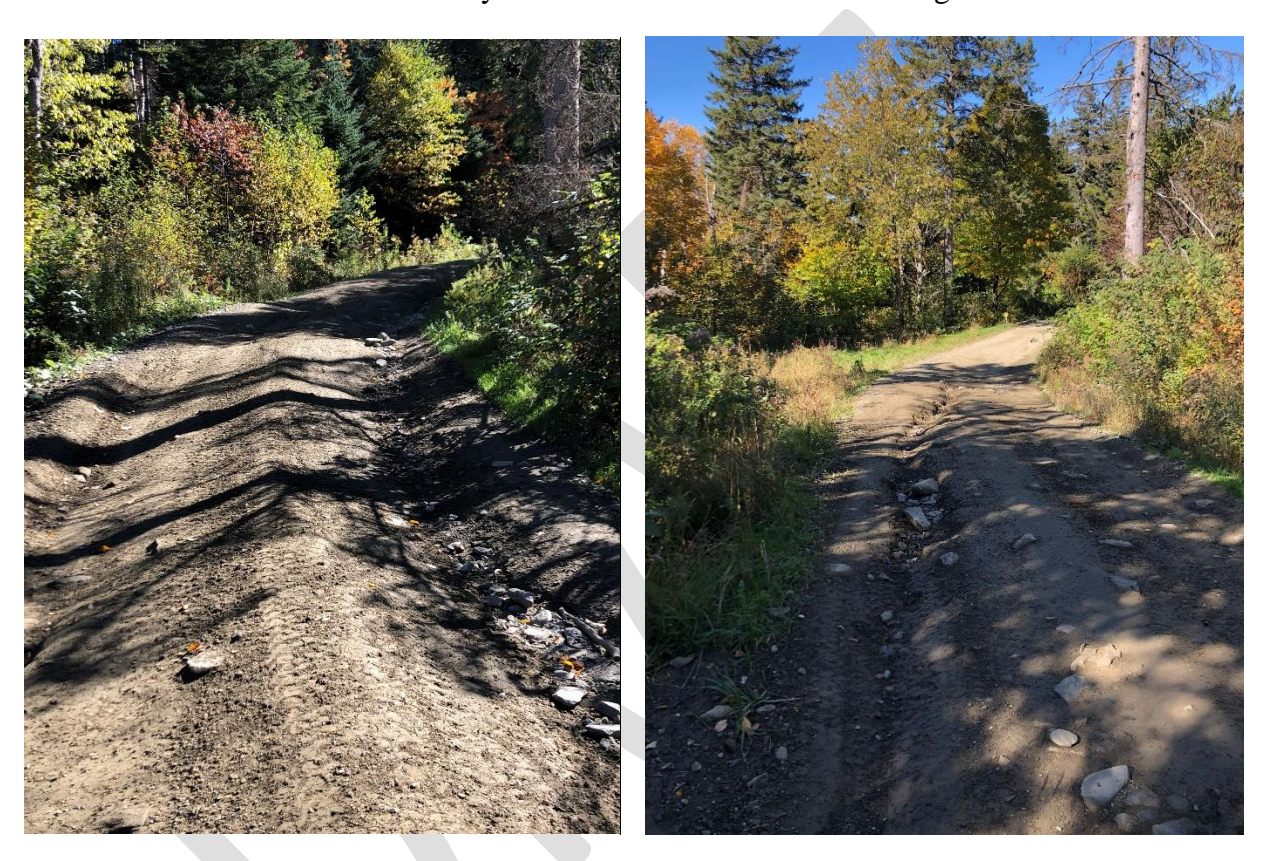
Figure 6- Shows condition of trail and some of the washing that had occurred.

Heading toward Diamond Peaks (Corridor C), on foot monitoring continued toward the boundary line. This trail was very hard packed, despite having no maintenance throughout the year. There were some sections that had minor sedimentation, meaning there was evidence of sediment that had been washed away from trail but the trail was in fair/good condition.