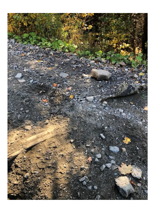
Figure 8- Depicting the rubber water diversion devices, where the rubber is completely missing.

Each year, the sharp corner leading up to Kelsey Notch gets a significant berm. This happens from the dirt and rocks getting kicked out as the OHRVs turn and head up the hill, exacerbated with speed.