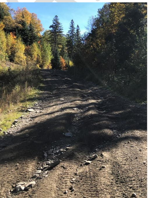
Figure 5- Shows the condition of the trail on the steep hill leading to the kiosk and the rubber water devices.