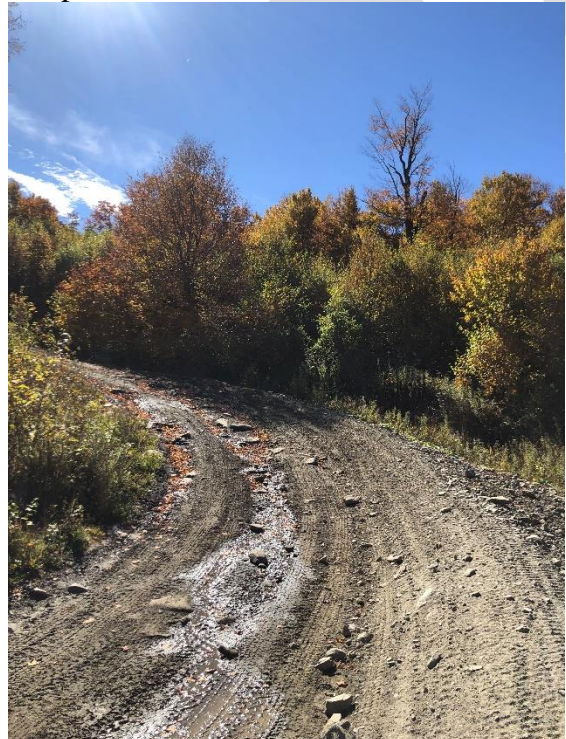
Figure 9- Shows berm on corner of trail

Each year, the sharp corner leading up to Kelsey Notch gets a significant berm. This happens from the dirt and rocks getting kicked out as the OHRVs turn and head up the hill, exacerbated with speed.