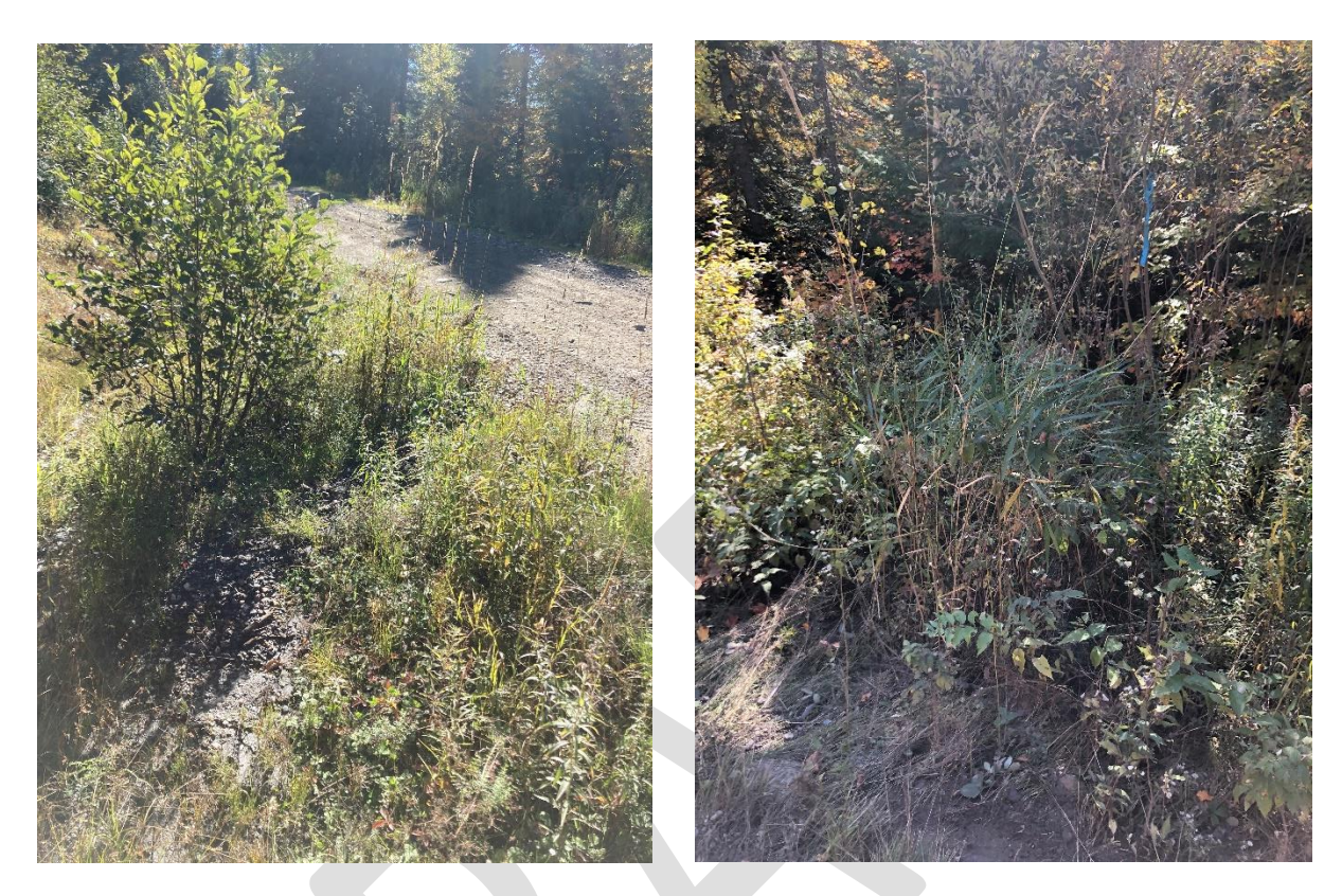
Figure 10- Depicts the area where the Phragmites australis was previously found in 2021, but no plants were found in 2022.

our 2022 visit, we found no evidence of new Phragmites australis plants and no living plants. This will continue to be monitored each year, during the growing season by Forests and Lands and Fish and Game staff.