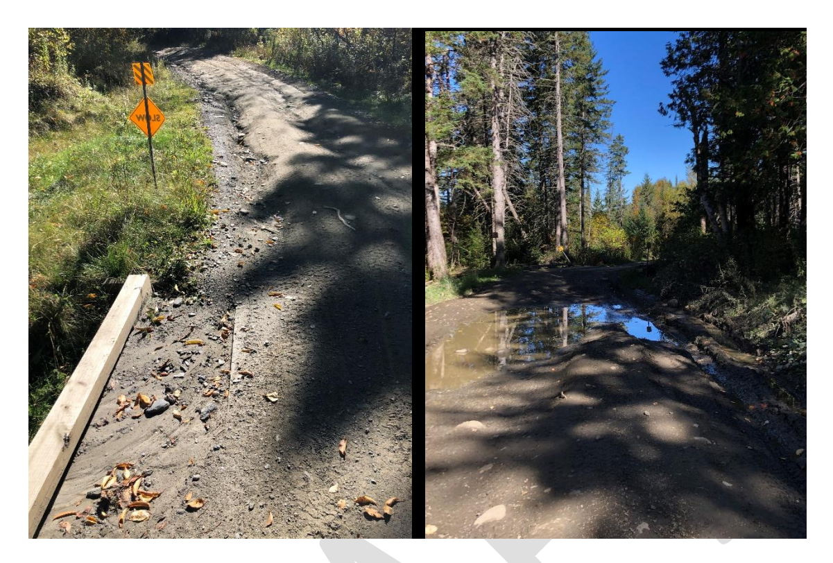
Figure 7- Shows sediment entering brook at bridge location and shows the "mud hole"