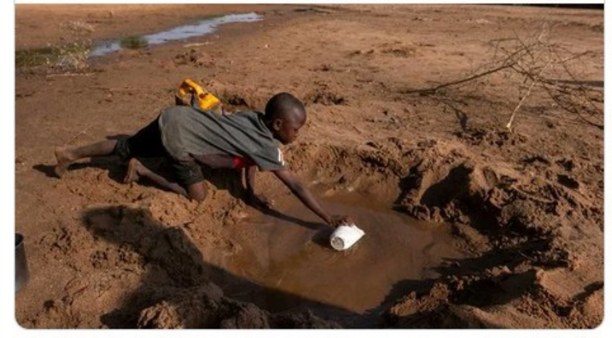
6:38 AM · Jun 4, 2022

Fridays For Future Uganda @ @Fridays4FutureU The impacts of #ClimateCrisis in Africa are already felt yet we emit only 3% of carbon. Our capacity to adapt is very very low. How does the global north feel about this