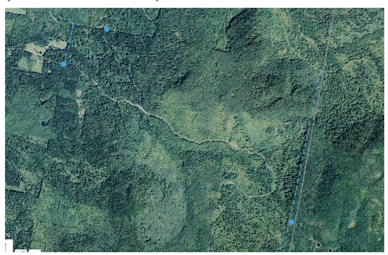
By 2014 the north branch cross-country ATV trail had been constructed: