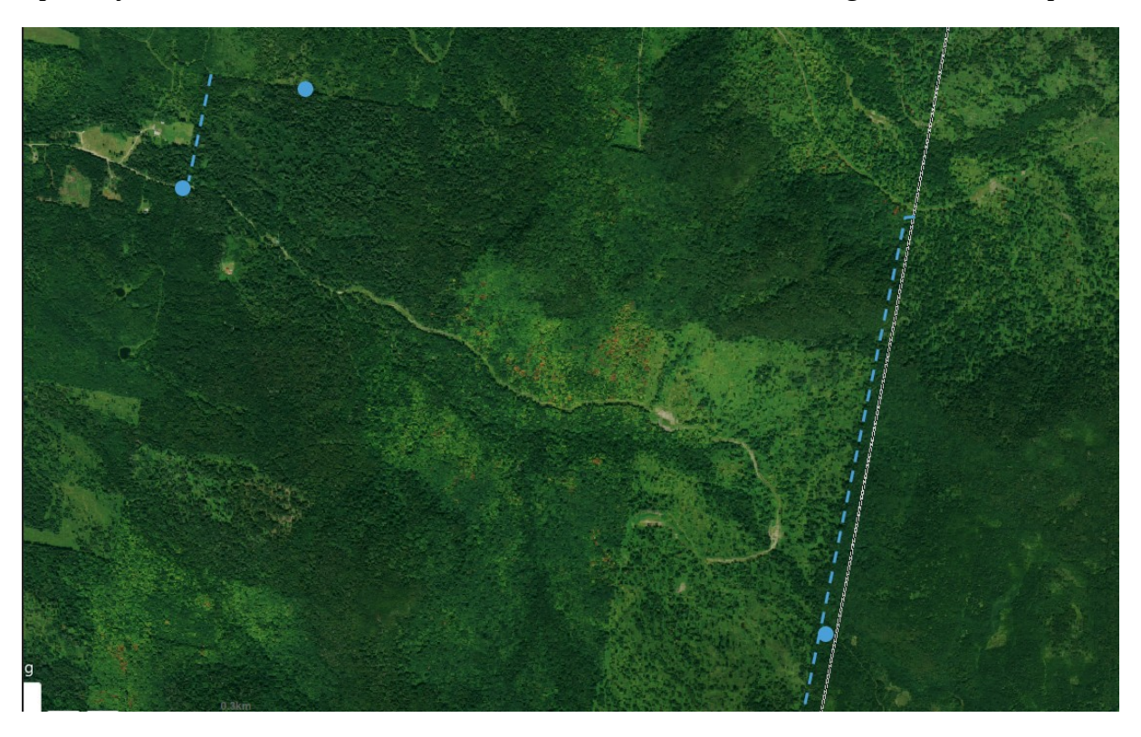
In 2013 cross-country ATV use was permitted by the State (DNCR/DRED.)

By 2008 the area was degraded by what appears to be logging road development and logging, especially in the southwest section. There was no WMNF/USDA oversight of this development.