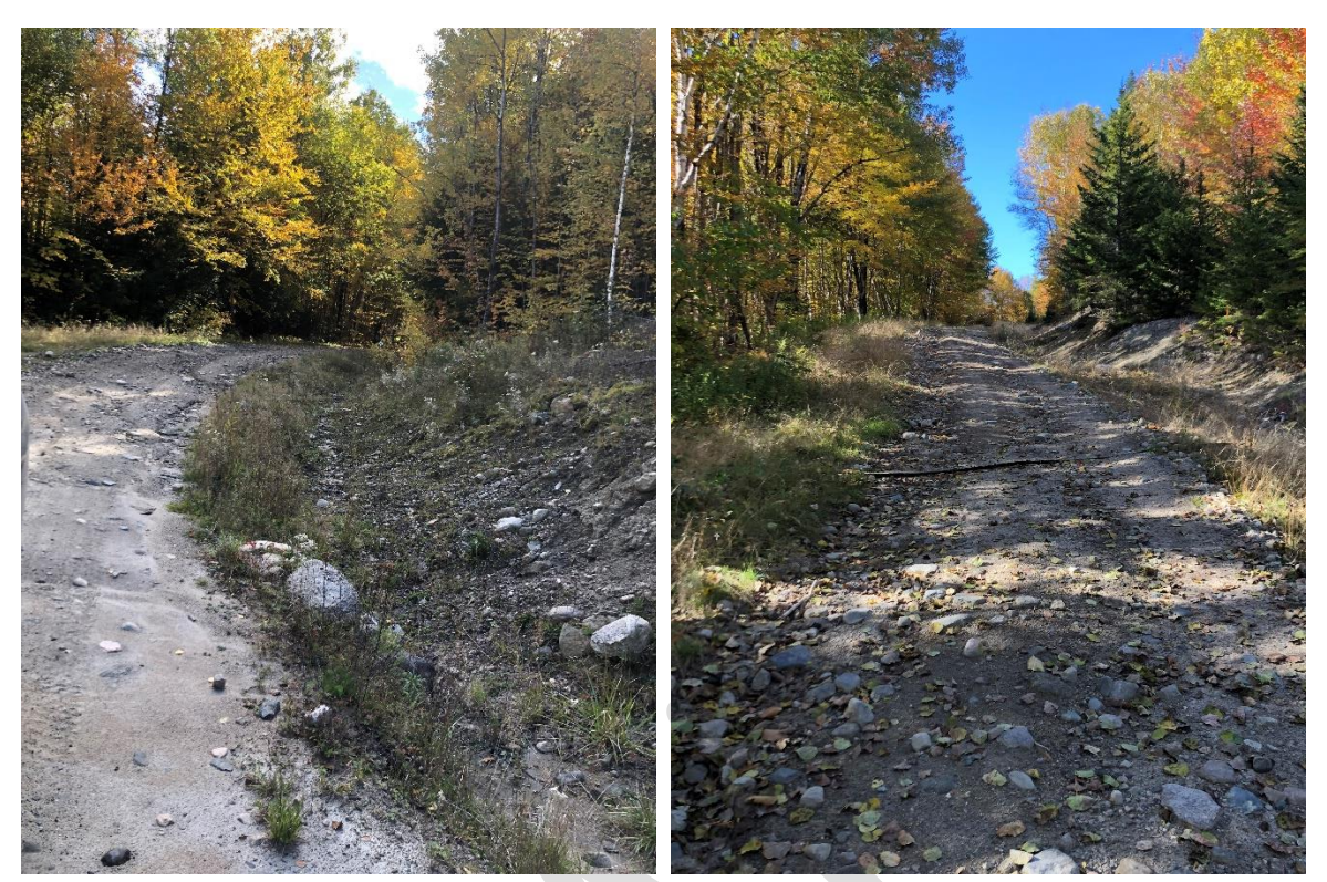
Figure 3- Depicts some of the trail conditions. .

Counters will be processed once the trail is closed for the season after December 15.