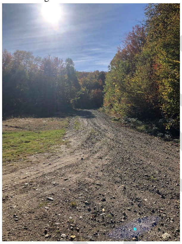
Figure 2- Depicts the intersection of the Bordeau Trail and Westside Road

Monitoring began at the cattle gate at the intersection of the Bordeau Trail and the West Side Road and proceeded out the Bordeau Trail all the way to the boundary line. The Bordeau Trail was in good condition. In 2019 and 2020, much of the entire Westside Trail was re-built and remains in good condition from that construction.