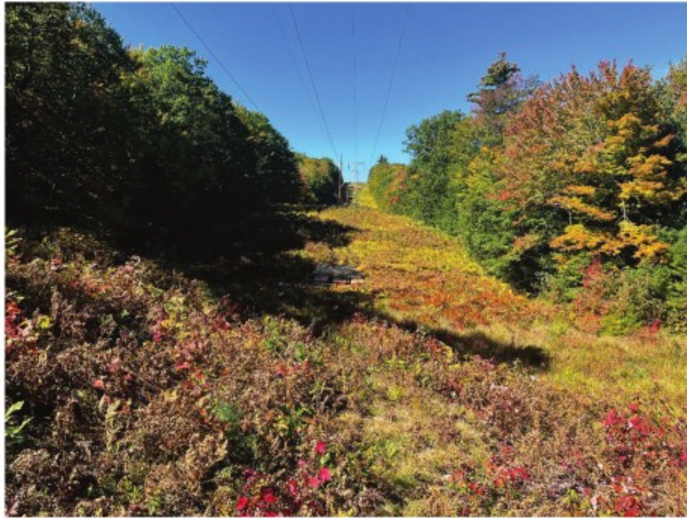
Photograph No. 3: View of Wetland SW-84 west of the smooth green snake sighting.