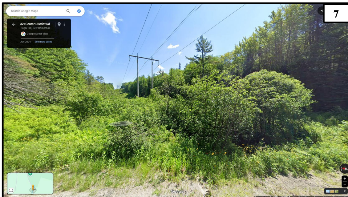
Center District Road, Sugar Hill, facing North ( 44^{\circ}13'38.6''\text{N} 71^{\circ}49'01.7''\text{W} ).