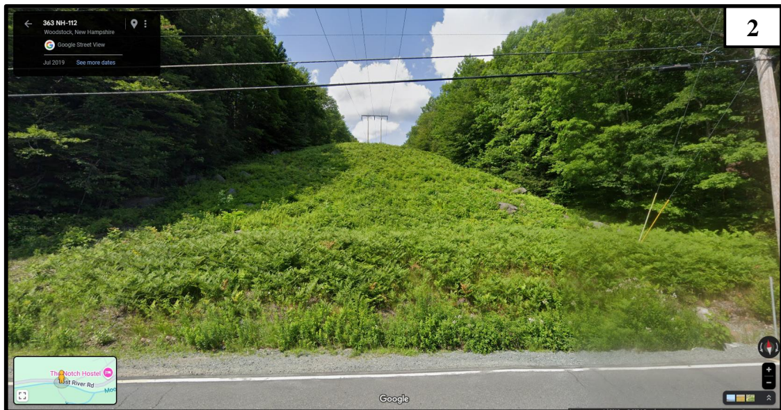
Lost River Road, Rt. 112, Woodstock, corner of Crooked Pike Road ( 44^{\circ}01'45.8''\text{N} 71^{\circ}42'36.1''\text{W} ).