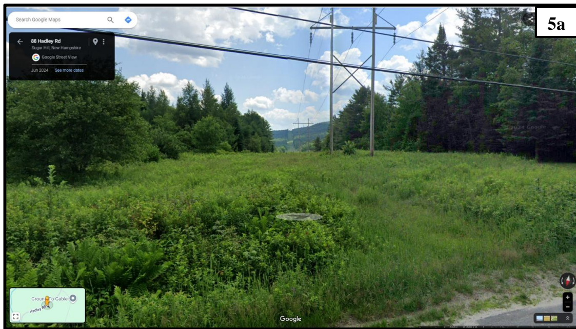
Hadley Road, Sugar Hill, near Nason Rd., facing North ( 44^{\circ}12'18.2''\text{N} 71^{\circ}48'43.9''\text{W} ).