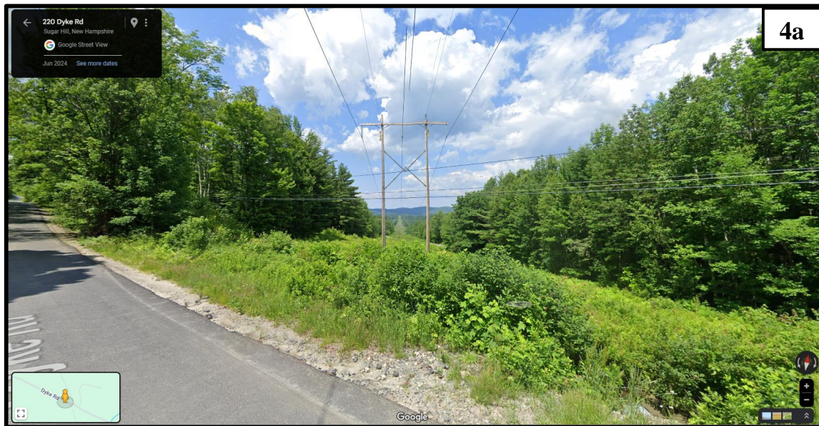
Dyke Road, Sugar Hill, near Presby Rd., facing South ( 44^{\circ}11'04.9''\text{N} 71^{\circ}48'20.6''\text{W} ).