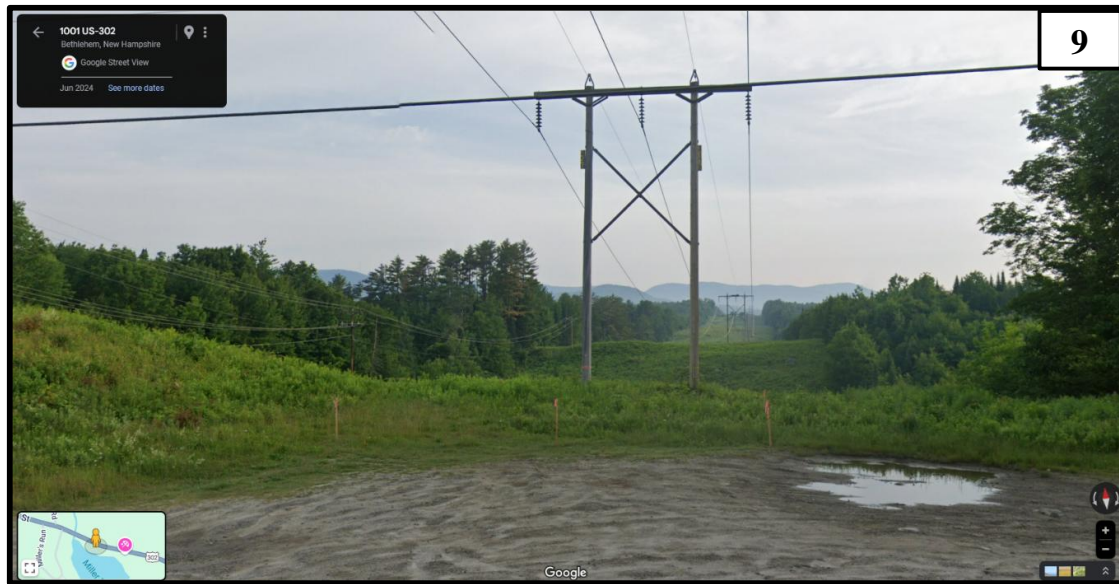
Whitefield Road, Bethlehem, near Briar Hill Rd., facing Southwest (44°19'24.0"N 71°40'41.7"W).