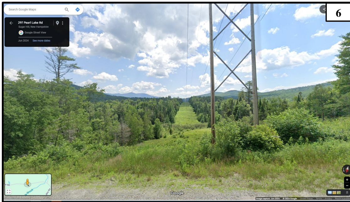
Pearl Lake Road, Sugar Hill, near Creamery Pond Rd., facing South ( 44^{\circ}12'35.1''\text{N} 71^{\circ}48'49.7''\text{W} ).