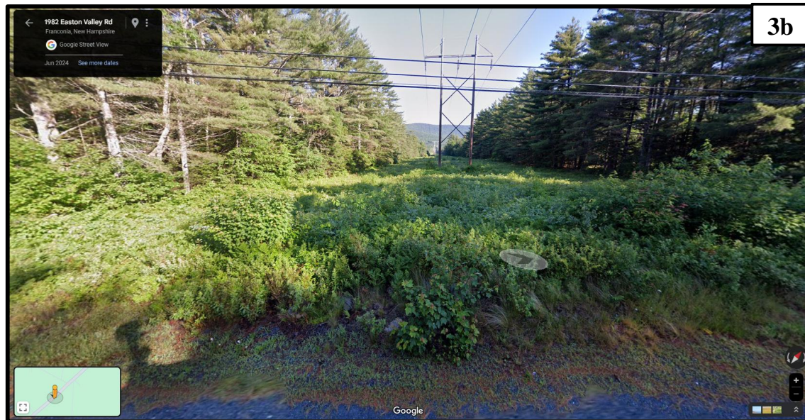
Easton Valley Road, Rt. 116, Easton, near Gingerbread Rd., facing Northwest ( 44^{\circ}07'41.5''\text{N} 71^{\circ}47'36.5''\text{W} ).