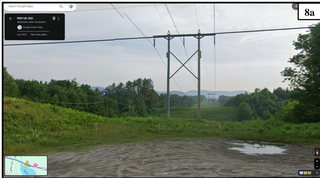
Route 302, Main Street, Bethlehem, near Rocks Edge Rd., facing South ( 44^{\circ}16'56.1''\text{N} 71^{\circ}43'36.2''\text{W} ).