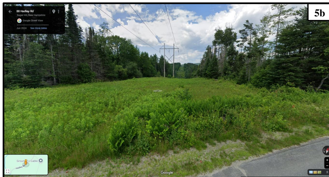
Hadley Road, Sugar Hill, near Nason Rd., facing South ( 44^{\circ}12'18.2''\text{N} 71^{\circ}48'43.9''\text{W} ).