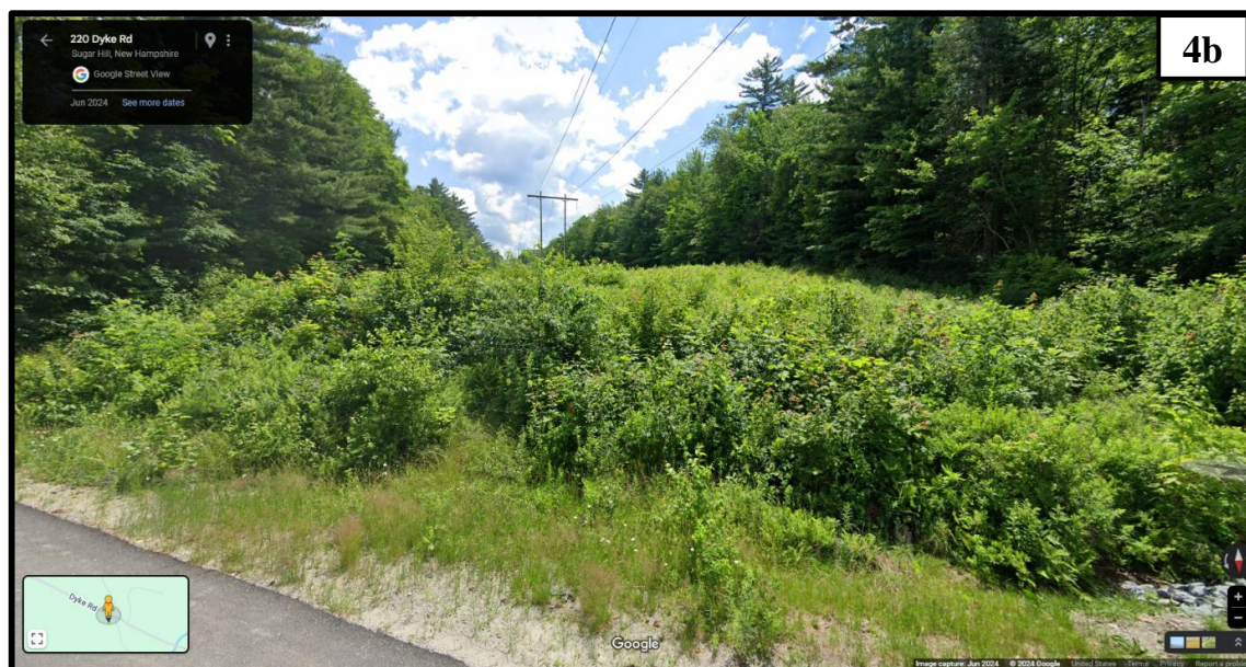
Dyke Road, Sugar Hill, near Presby Rd., facing South ( 44^{\circ}11'04.9''\text{N} 71^{\circ}48'20.6''\text{W} ).