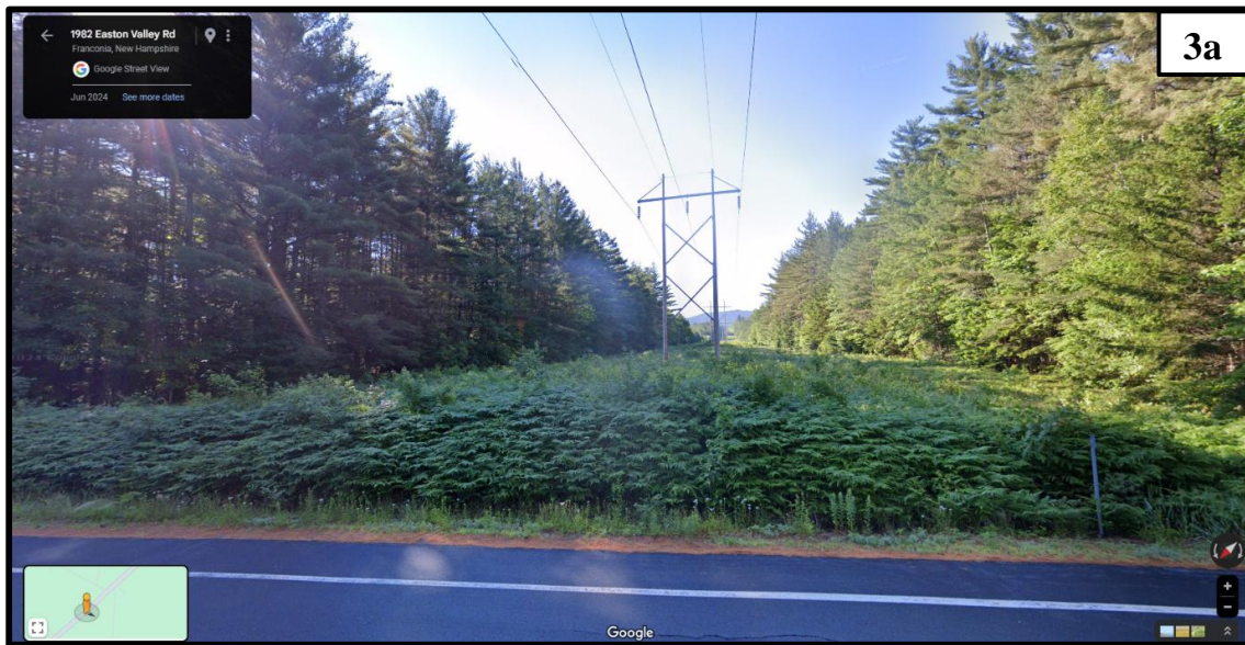
Easton Valley Road, Rt.116, Easton, near Gingerbread Rd., facing Southeast ( 44^{\circ}07'41.5''\text{N} 71^{\circ}47'36.5''\text{W} ).